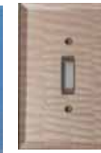
Glass Light Bronze