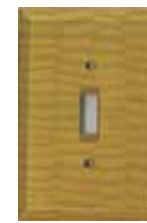
Glass Light Gold