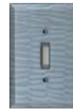
Glass Light Sapphire