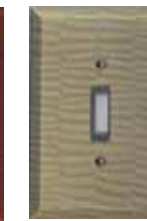
Glass Deep Opal