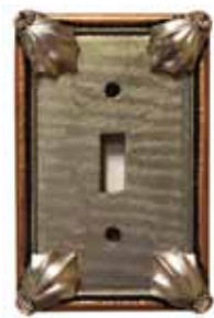
Cleo Deep Opal/Amber

Created to coordinate with our decorative hardware and furnishings, our switch plates and outlet covers are constructed from various materials, including cast resin, metal and beveled glass. Available in multiple configurations with matching screws, they are the perfect accent for painted walls, white backdrops, and tiled surfaces.